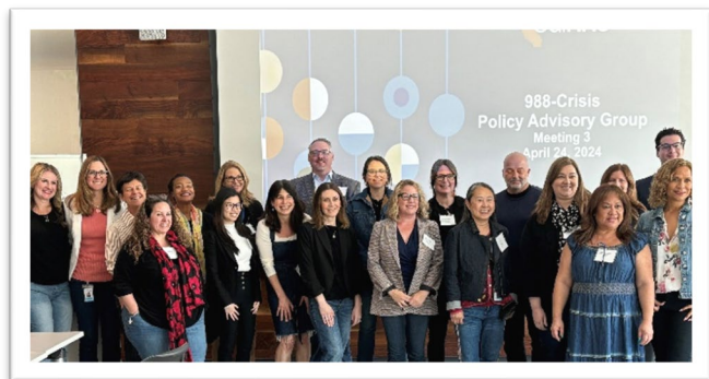
Policy Advisory Group members gathered at the Allenby Building in Sacramento on April 24, 2024

The 988–Crisis Policy Advisory Group met on April 24 and June 26, 2024, to discuss recommendations emerging from several different workgroups: Statewide 988 Standards and Guidance (Workgroup 2), 988–911 Behavioral Health Crisis Care Continuum Integration